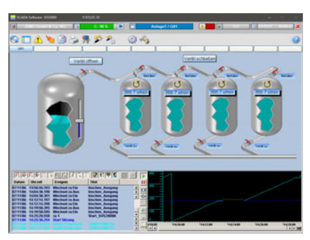
SVS3000 application mimic