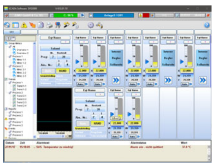
SVS3000 grouped mimic

The network can be expanded to include additional PCs at any time.